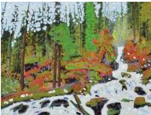
Sheila Kernan , Catching Dreams , mixed media on canvas, 36" x 48".

Research is an enjoyable aspect of art collecting. Attend "meet the artist" receptions; read reviews in newspapers and magazines to see what critics say about the artist or the genre that interests you.