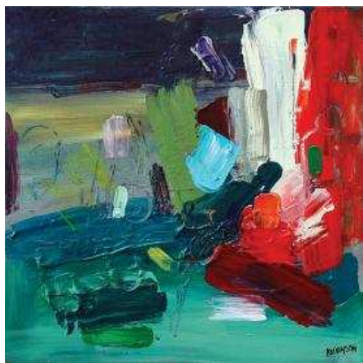
Scott Pattinson, Pacific #58 , acrylic on canvas, 12" x 12".

Use the internet, Facebook and Twitter to search out new artists. Don't be afraid to email or text the artist or the gallery with questions, to find out about new work and upcoming exhibitions. Enjoy the thrill of the hunt – however, you choose to hunt!