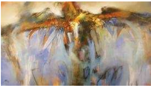
Blu Smith , Eagle Perch , mixed media, 54" x 96".

Don't hesitate to visit galleries often — they're free. It's one of life's great pleasures. And if you see something you like, ask the staff whether you can try the painting at home before you commit. Layaway possibilities are also worth asking about.