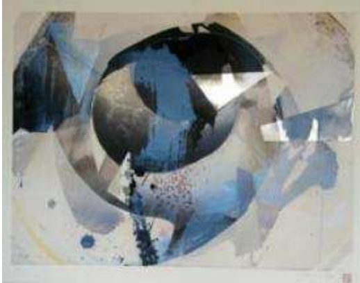
Wayne Eastcott , For S.H.1 , silkscreen, digital, and stenciled enamel on aluminum and paper, 34" x 44".