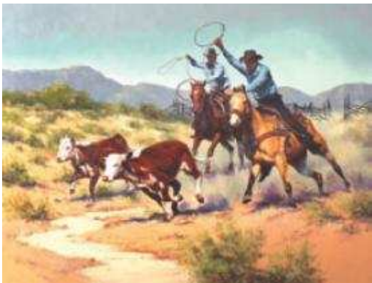
Harold Lyon, The Great Escape , oil on canvas, 36" x 48".

Don't be concerned about too much art. It's fun to take down pieces and replace them with something else, then bring them out and hang them in a different location to see them in a different light or context. Go ahead and play curator with your collection.